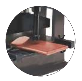
Bus Bar Cutting