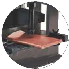
Bus Bar Cutting